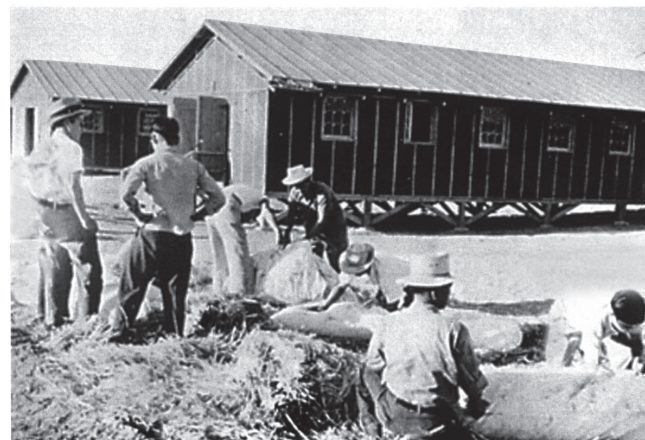
Prisoners fill their mattress bags with straw.