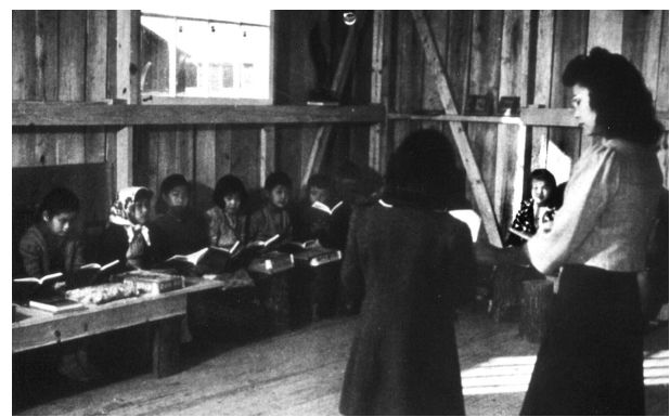
School begins in September, 1942, in an empty barracks room with a college student as teacher and with desks and chairs made from scrap wood.

(The 442nd RCT received 7 Presidential Unit Citations)